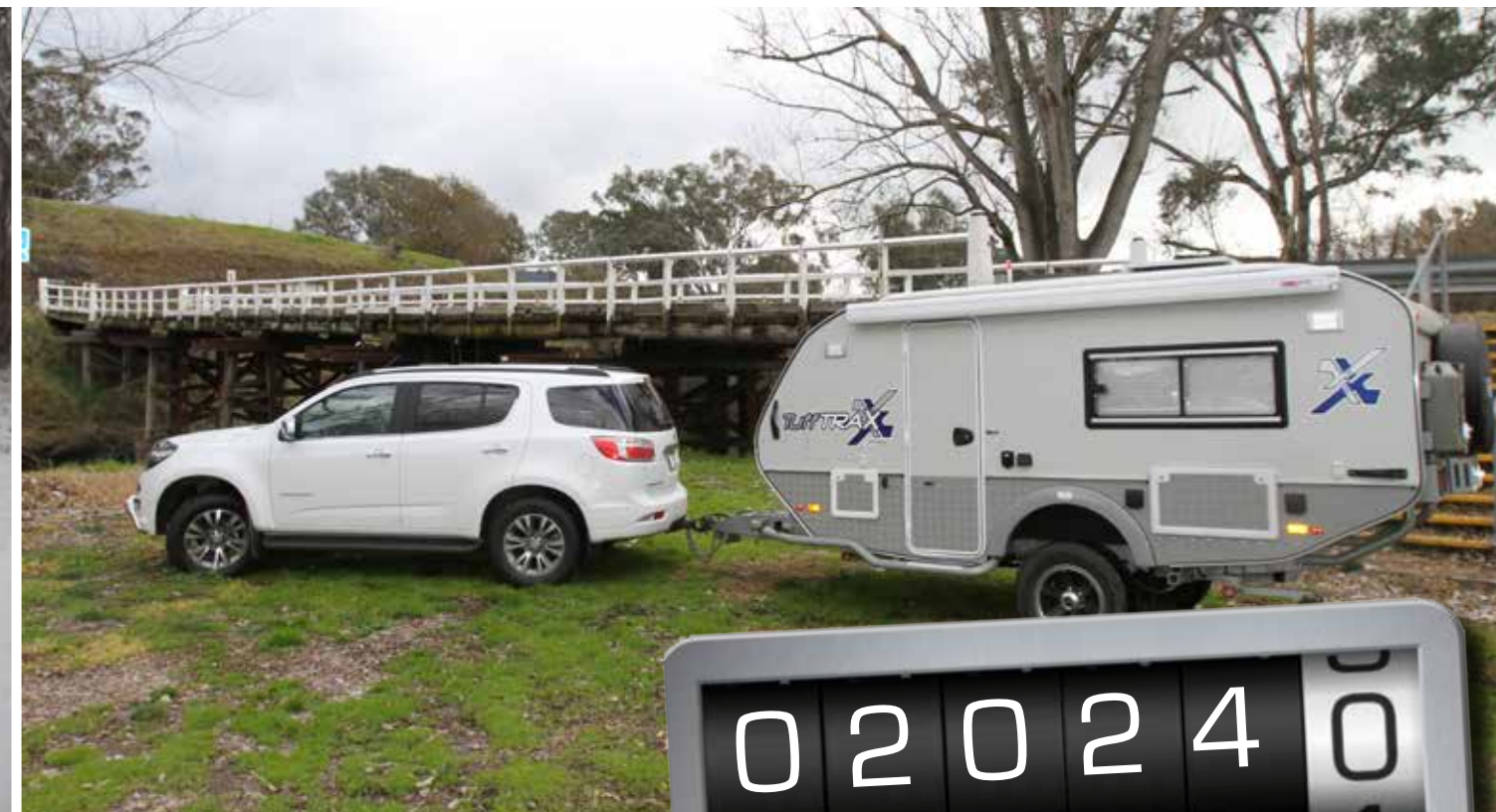
Above: We took the Trailblazer and Jurgens up to the snow and they performed well. Right: The Trailblazer has a 3 tonne towing capacity and the Tuff Trax comes with Cruisemaster XT suspension ready for the rough stuff.